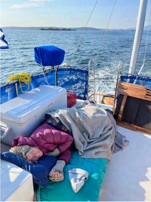
Photo: en route to desolation sound in June 2023 at 5:20 in the morning ...my favourite time to travel or snooze if I'm not at the helm.

Any comments or messages for LYC members? Volunteering with LYC is a great way to meet other boaters.